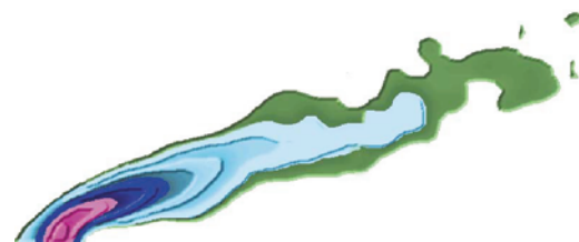
(b) z/b = 0.4