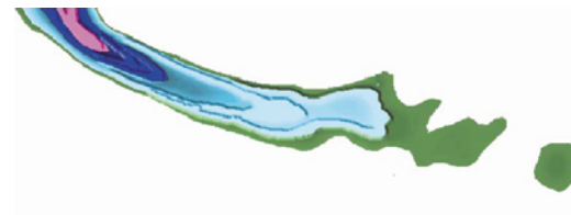
(a) z/b = 0.2