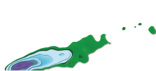
(c) z/b = 0.8